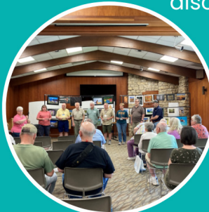
The 28th Annual TWC Nature Photo Club Foto Fest Awards

As always, our clubs provide a great opportunity to connect through activities, meetings, and events, including geocaching events, birding activities, astrophotography workshops, star watches, botany hikes, book discussions, and offsite hikes.