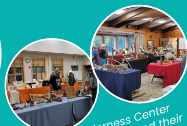
The Wilderness Center Woodcarvers hosted their 38th Annual Woodcarvers Show in September.