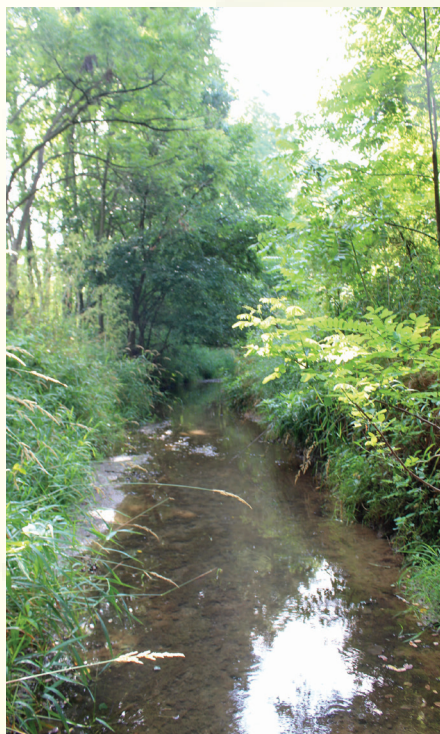
The channelized portion of the Fox Creek that will be restored.

When the natural stream sinuosity is restored, this will allow for decreased erosion and greater habitat quality