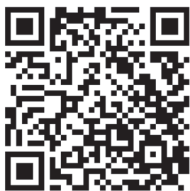
Scan the QR Code for more info on the Benches to Bottlecaps Program

Want to get your school, class, club, or group involved? Let's make this a competition! Be the group to bring us the most caps and everyone in your group will have a bench named and engraved in your honor and everyone in your group will receive a TWC magnet! To register your group to be part of the competition, email twc@wildernesscenter.org .