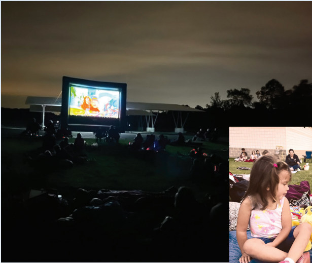
Our first annual Outdoor Family Movie Night was so much fun! Families enjoyed educational activities, a scavenger hunt, and the movie "The Lorax" under the stars.

Because of YOUR support, TWC shared new adventures and new events with new friends this year!