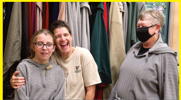
Volunteers are the backbone of TWC. Thanks to over 2,400 hours of work by 150 volunteers, we are able to provide amazing services, programs, and events to our communities.