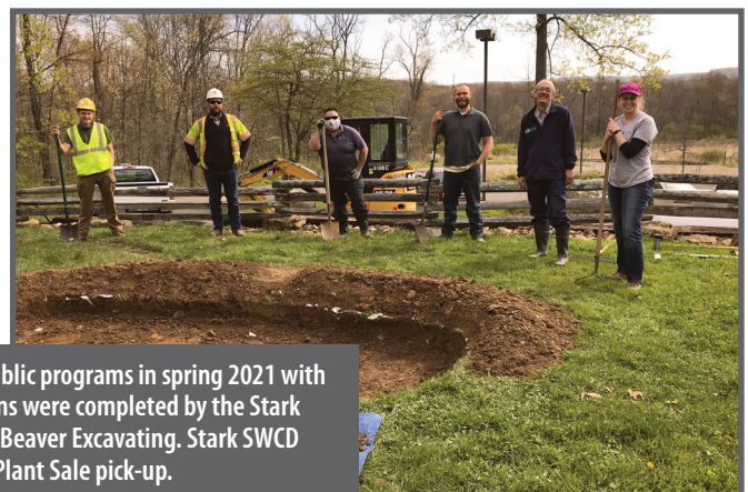
The Backyard Habitat Initiative conducted eight public programs in spring 2021 with online and in-person options. Two demonstration rain gardens were completed by the Stark Soil and Water Conservation District with donated help from Beaver Excavating. Stark SWCD conducted a rain garden display on May 1 during the Native Plant Sale pick-up.