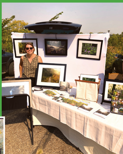
This year's Nature Fest Artists' Market was held outdoors for safety, but that meant the event could grow! It featured over 30 artisans and our Education Team facilitating nature-themed crafts for children and adults.