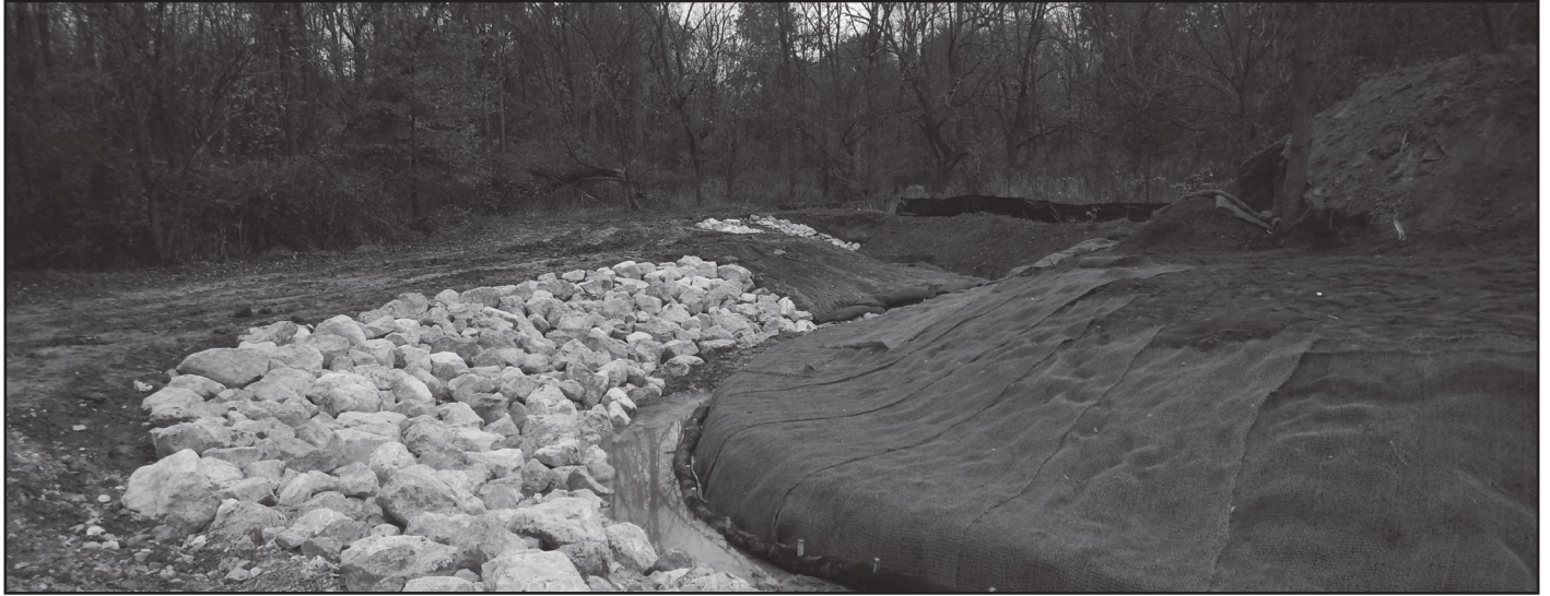
An earlier stream restoration was completed on a stretch of Fox Creek in 2016.

The Wilderness Center is working with The Nature Conservancy's (TNC) stream mitigation team on a second project on Fox Creek here in Wilmot. The project will restore more than 2,300 feet of Fox Creek, and more than six acres of wetlands and floodplain. Projects like this take longer than most people would expect, and involve the efforts of many different agencies and community partners.